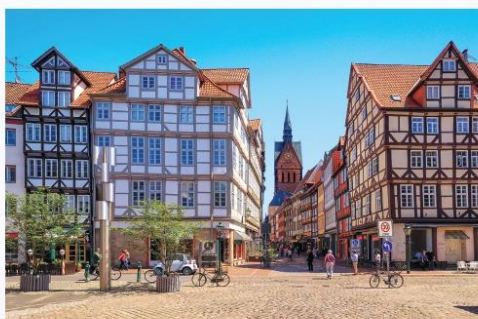
Old Town Hannover