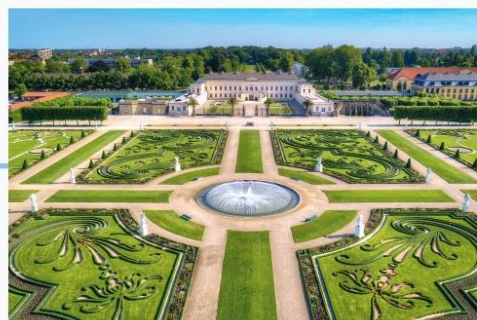
Royal Gardens • © HMTG